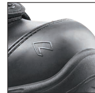
HAIX® Composite Toe Cap