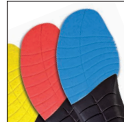
Vario Wide Fit System